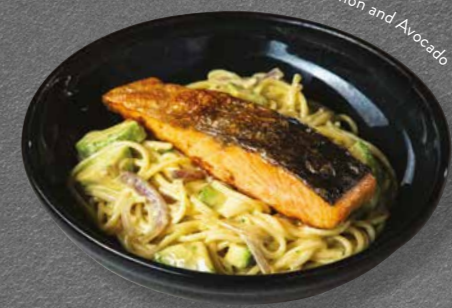
Salmon and Avocado

GF - GLUTEN FREE OPTION AVAILABLE Please let us know if you would like the meal gluten free. Chips are replaced with either mash potato, rice or rustic potatoes.