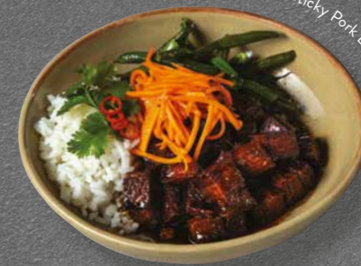
Sticky Pork Belly