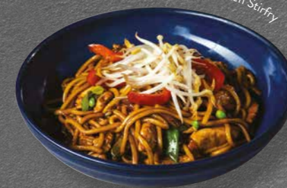
Chicken Stir Fry